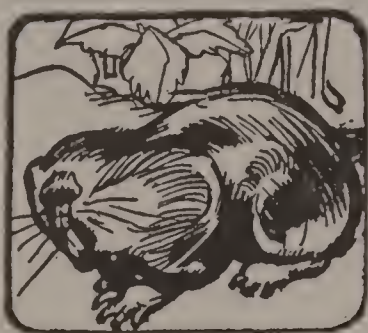
Mr. Mole Would Laugh and Laugh.

“OF all the animals the farmer dislikes,” began daddy, “I think the mole takes the lead, for he is more destructive to the farmer’s land than any other animal if he wishes to be. And Mr. Mole hates the farmer too.